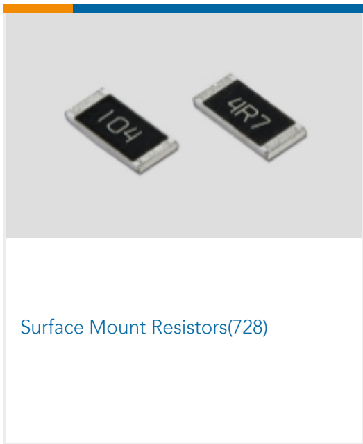
Surface Mount Resistors(728)