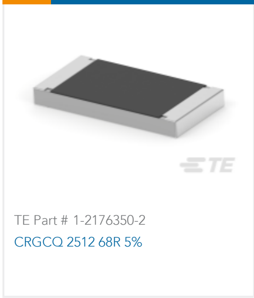
TE Part # 1-2176350-2 CRGCQ 2512 68R 5%