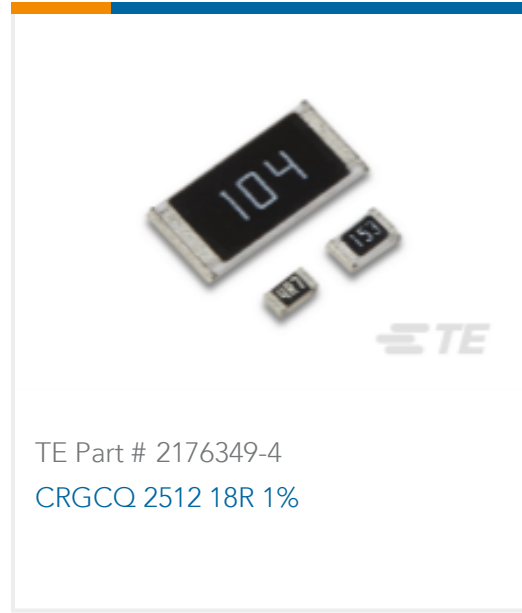
TE Part # 2176349-4 CRGCQ 2512 18R 1%