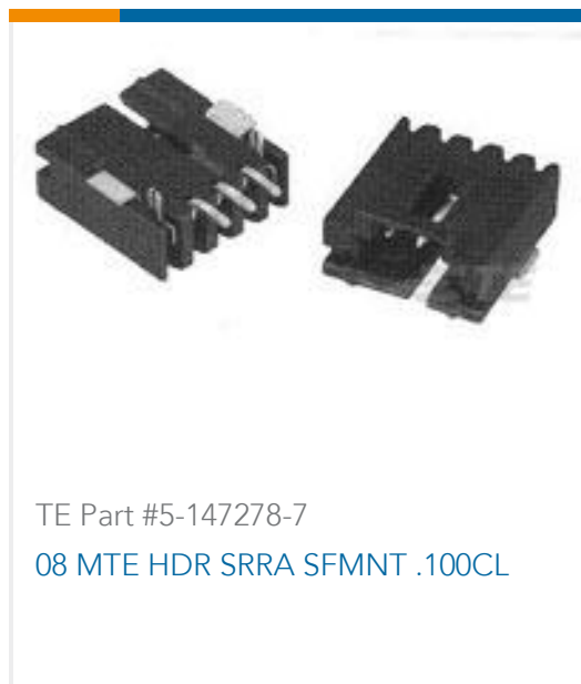
TE Part #5-147278-7 08 MTE HDR SRRA SFMNT .100CL