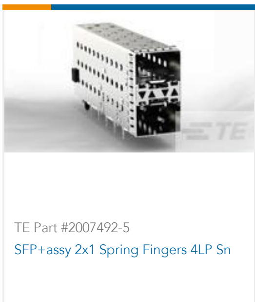
TE Part #2007492-5 SFP+assy 2x1 Spring Fingers 4LP Sn