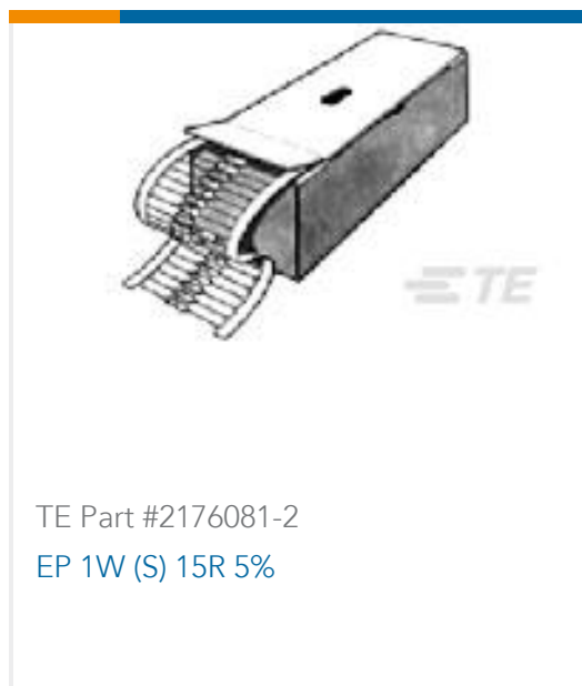
TE Part #2176081-2 EP 1W (S) 15R 5%