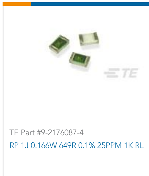
TE Part #9-2176087-4 RP 1J 0.166W 649R 0.1% 25PPM 1K RL