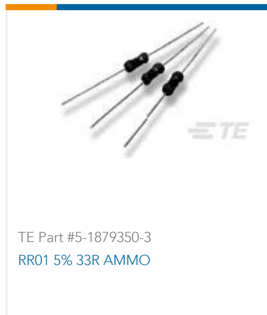
TE Part #5-1879350-3 RR01 5% 33R AMMO