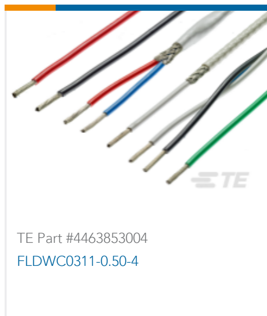
TE Part #4463853004 FLDWC0311-0.50-4