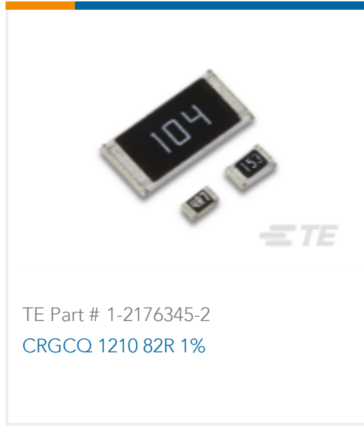
TE Part # 1-2176345-2 CRGCQ 1210 82R 1%