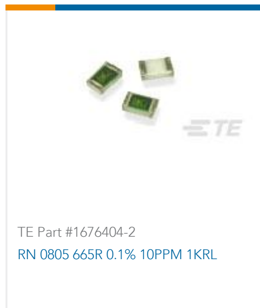
TE Part #1676404-2 RN 0805 665R 0.1% 10PPM 1KRL