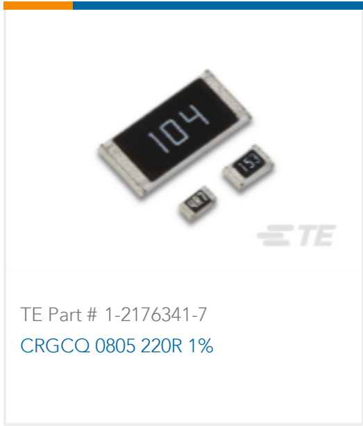
TE Part # 1-2176341-7 CRGCQ 0805 220R 1%