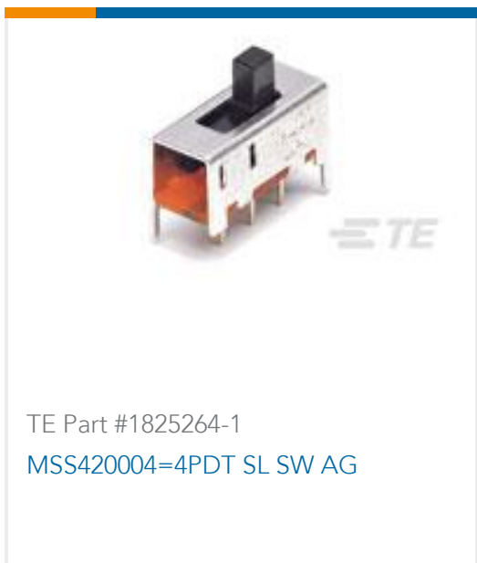
TE Part #1825264-1 MSS420004=4PDT SL SW AG