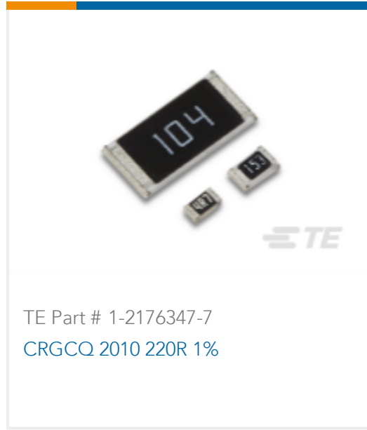
TE Part # 1-2176347-7 CRGCQ 2010 220R 1%